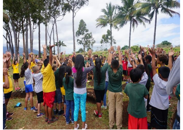
95 haumana offer their makana of mele and hula