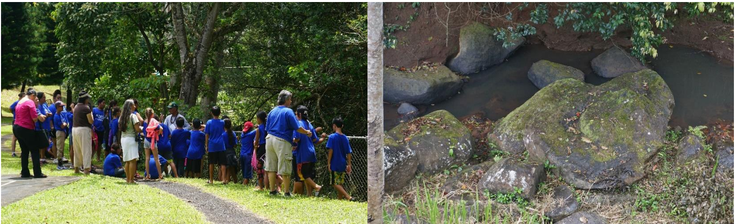
Site interpretation of O‘ahunui a me O‘ahuiki located in Waikakalaua Stream, Launani Valley, Wahiawā.

5.18.2k16... “Pū‘ōhala Elementary School Kane‘ohe is where the English program is complemented by a Hawaiian language immersion program. All subjects are taught in the Hawaiian language for the entire school day. English is introduced into the immersion program in grade 5, allowing immersion students to be bilingual when they complete Grade 6.” Haumana joined us at O‘ahunui, Kūkaniloko and Kaiaka Bay for site interpretation. Mahalo for visiting...eō