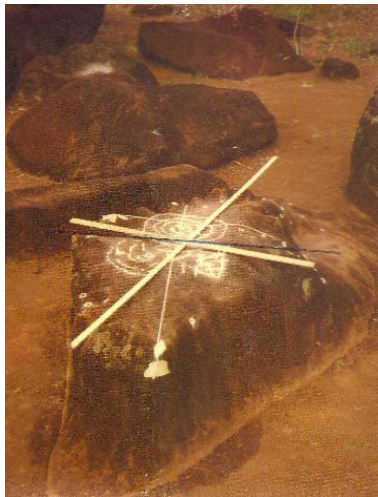
Diamond Stone Compass Kūkaniloko