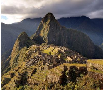
Machu Picchu Peru, South America