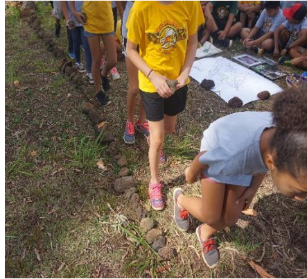
Each haumana picked up ili'ili on their journey down the road to Pa Pōhaku o Kamana'olana, the Stone Wall of Hope.