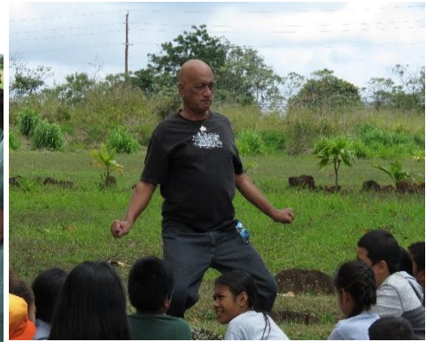
Hawaiian Civic Club of Wahiawā nā lālā 'ōiwi share the responsibility of perpetuating our mo'olelo...