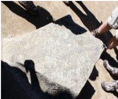
Diamond Stone Compass Machu Picchu