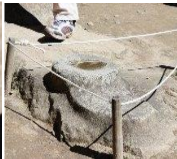
Pōhaku with bowl to fill with water to study star movements